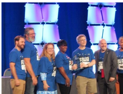
< FSU delegates with UFF and FEA leaders

Speaking of money, one report concerned a corporate funded (and dark money-funded) Freedom Foundation that is working to undermine American unions - including ours in Florida. The Foundation is contacting union members to advise them of their right to quit the union, and pressing the Commission that hears our Unfair Labor Practice charges to see things their way. Their way is that, "For too long, corrupt union bosses have controlled America by controlling their members' paychecks. But today, people in all 50 states are coming together to reclaim their freedom." Later, at the FEA Assembly (see below), delegates were told that the Freedom Foundation was targeting the Miami-Dade school district.